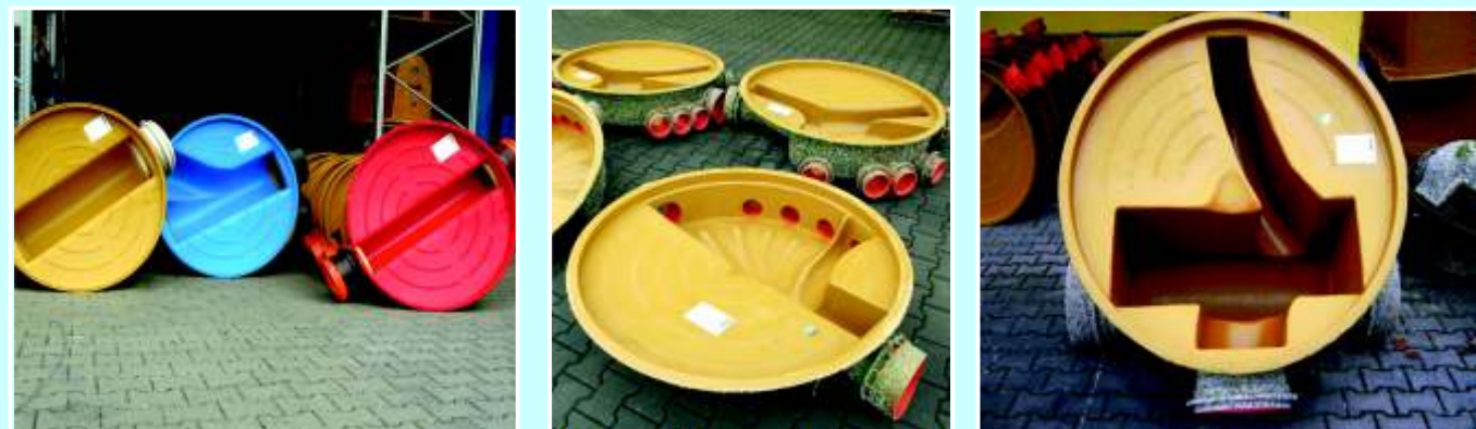
Standard base-liners in PP, specials in GRP; different colours are available on request