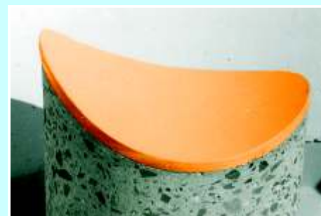
Precast concrete quality no less than C 40/50