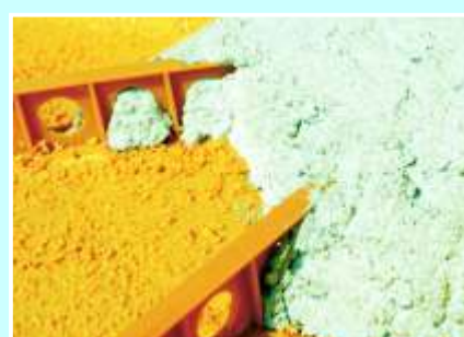
Bouding bridges for a reliable concrete connection