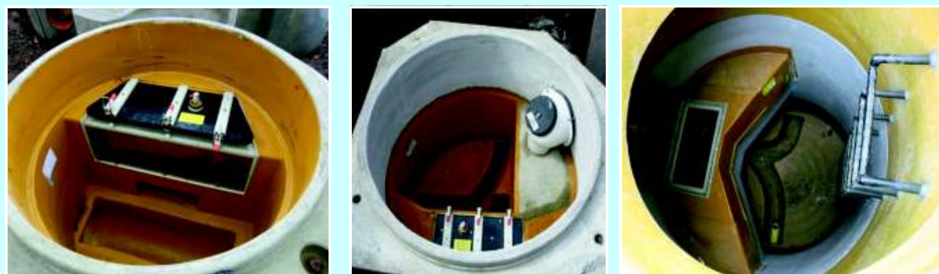
INFRA / MULTRO Manhole base-liners: sewer and storm waters in one single manhole