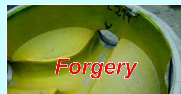
With a minimum thickness of 4 mm in the sole