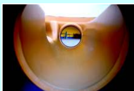
Smooth and step free channel, hydraulically ideal