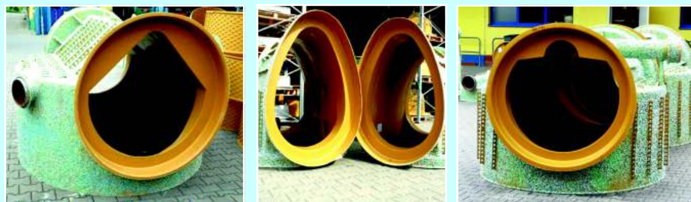
Special channels: dragon mouth, connections for egg shaped pipes and dry weather channel