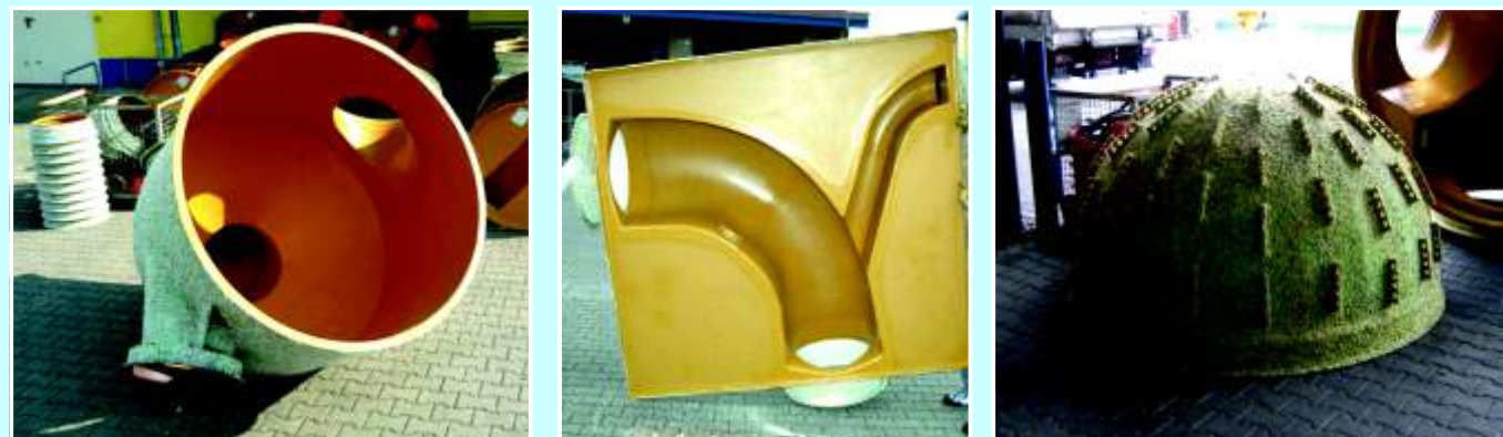
Special designs: energy reducer manhole, square manhole base-liners, catch pit base-liner