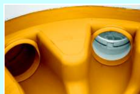
Inlet branches at any angle (can also be retrofitted)