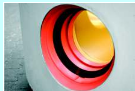
Connection of all pipe types possible